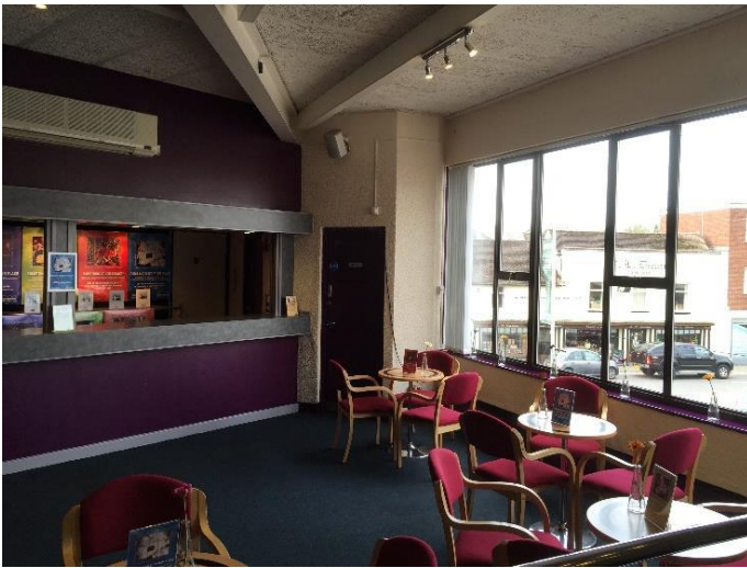
This is the Chess bar