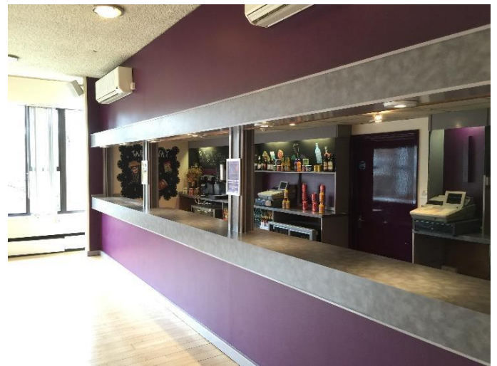
This is the Colne Room bar (quiet area)