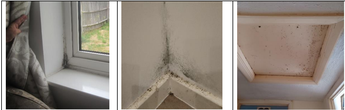
Level 1: Signpost (see pages 3, 4 & 5)