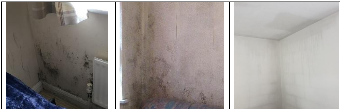
Level 2: Refer to Local Authority or Housing Association (see pages 3, 4 & 5)