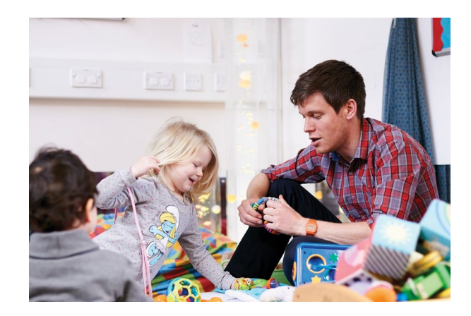
Charity number 1132581 | Company number 6952404