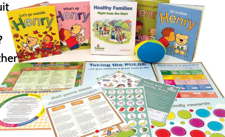
The HENRY Parent Toolkit

HENRY is a charity working to give babies and young children a healthy start in life.